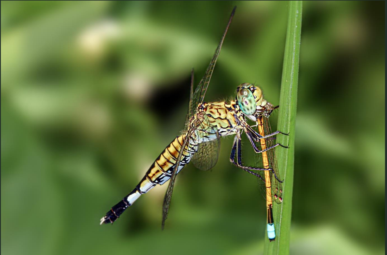
Third place: Feeding -Grizzled pintail ( Acisoma panorpoides feeding on Ischnura rubilio), Address: PO Box 396, Ibri 516, Sultanate of Oman. Photo taken on 29.05.2022 at Trichur, Kerala. Canon 70 D, Canon 100 mm macro 2.8, 1/100 sec, f/16.0, ISO 125, 100 mm