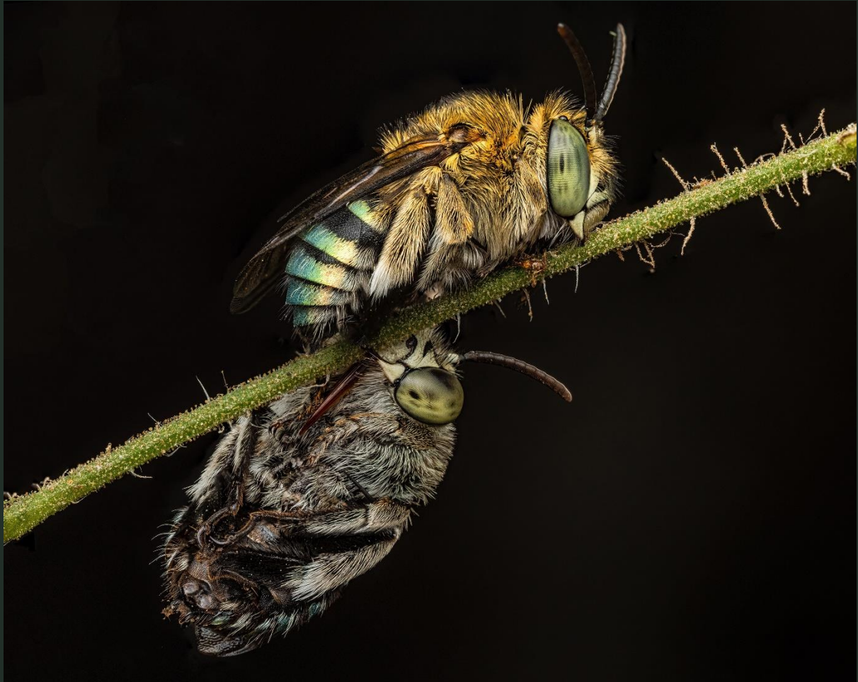
Best Photo: Seeing Double: Pair of Blue banded bees ( Amegilla sp.) roosting with their mandibles clamped to a twig. Photo taken on 12.02.2022, Nikon D850 DSLR Venus Laowa, 100mm 2x Macro Lens, 1/200, ISO200, F11, 11.2 MP.